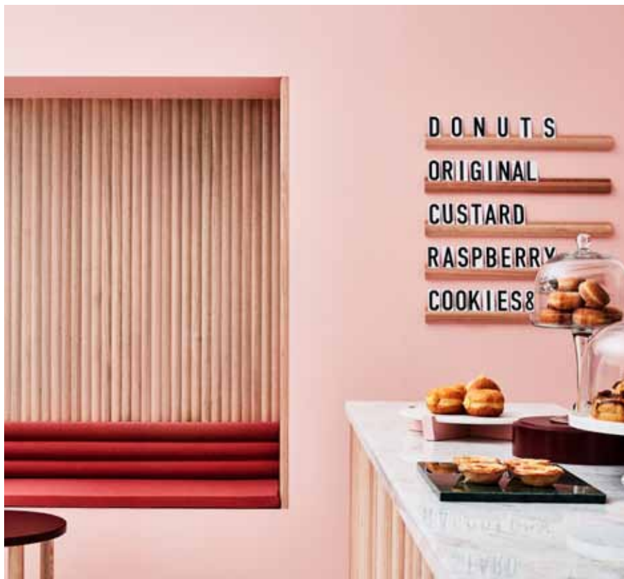
Contours Profile: Riverine