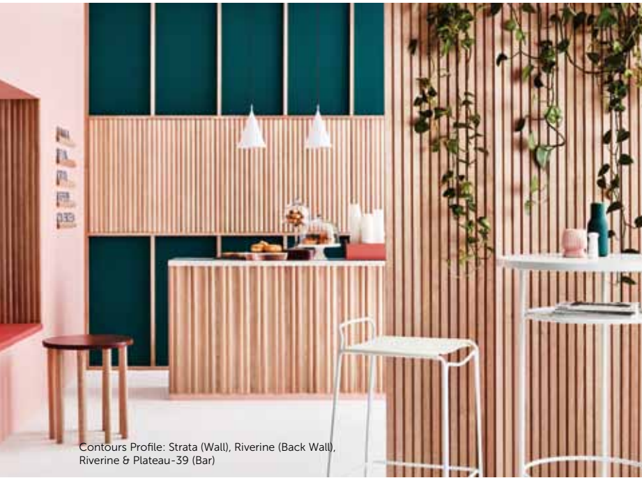
Contours Profile: Strata (Wall), Riverine (Back Wall), Riverine & Plateau-39 (Bar)