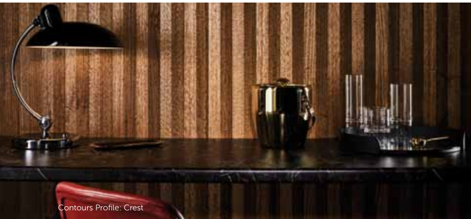
Contours Profile: Crest