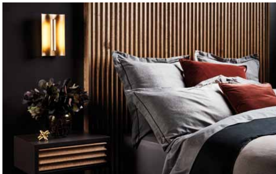
Contours Profile: Cirque

Porta Contours, inspired by the contours of the beautiful Australian landscape are available in 6 profiles as well as custom designed lining board designs in Select grade Tasmanian Oak hardwood and other certified timber species.