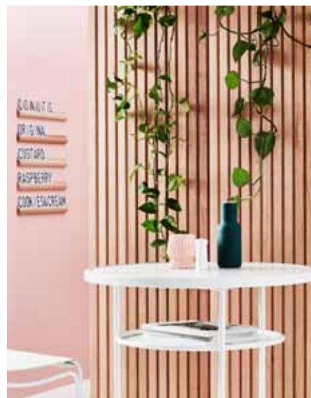
Wattyl 270-062 Walnut timber stain