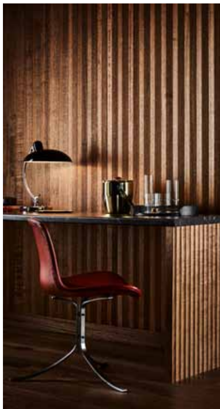
Contours Profile: Crest

*Tested in accordance with the requirements of NCC specification C1.10