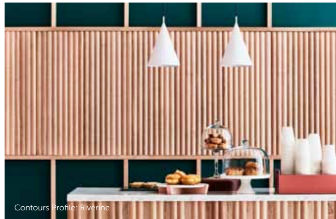
Contours Profile: Riverine