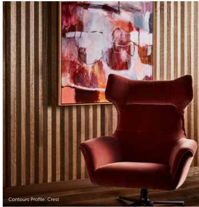
Contours Profile: Crest