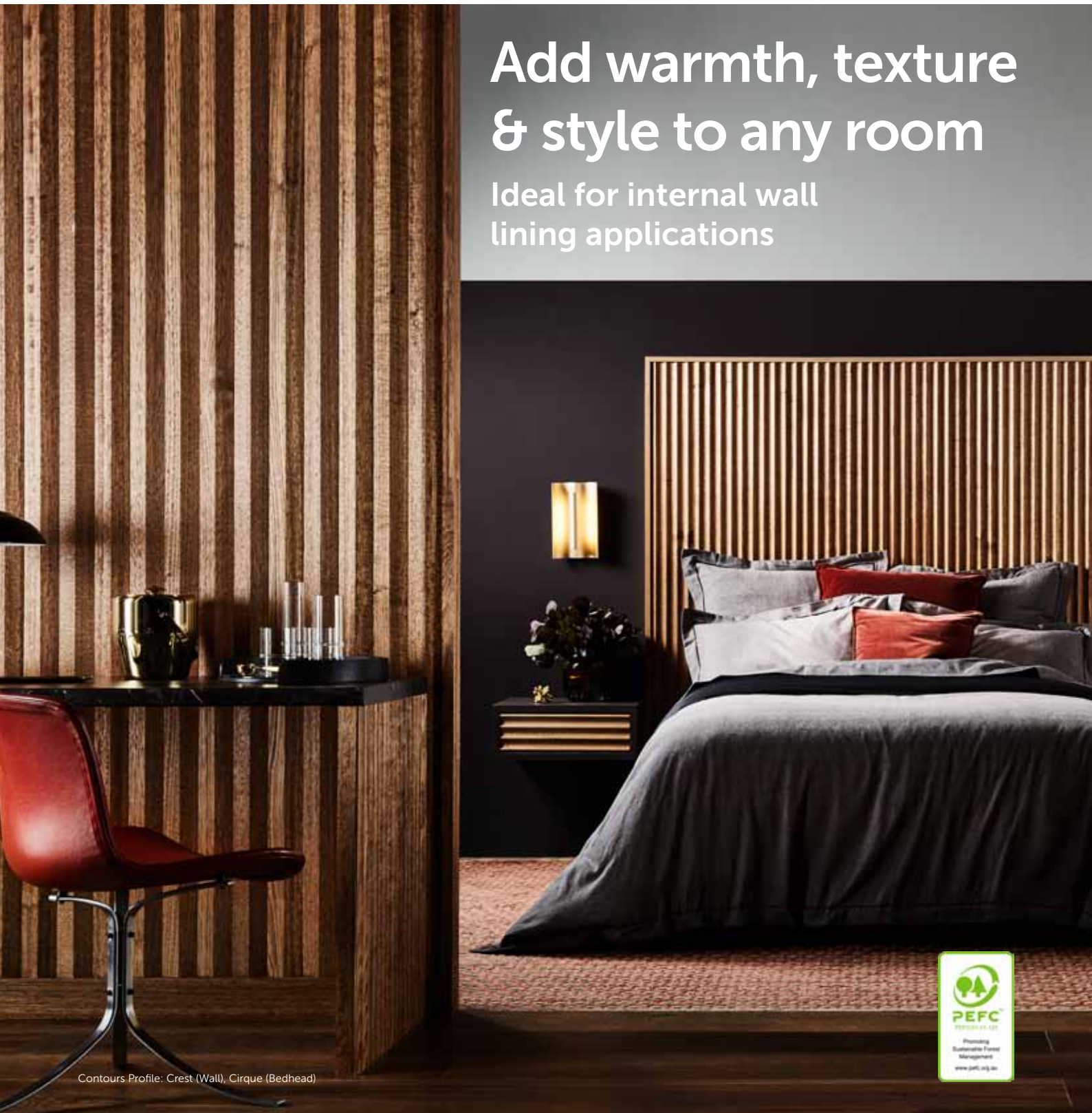
Contours Profile: Crest (Wall), Cirque (Bedhead)

Ideal for internal wall lining applications